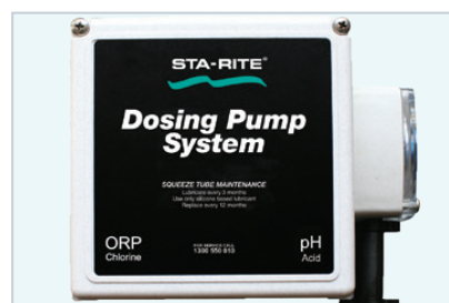
Optional pH Doser For Automatic Water Balance