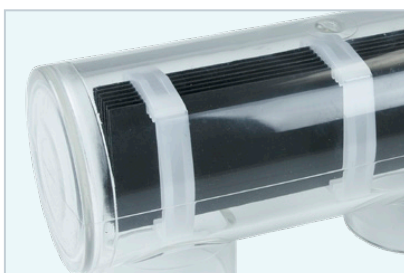
Reverse-Polarity, Self Cleaning Cell