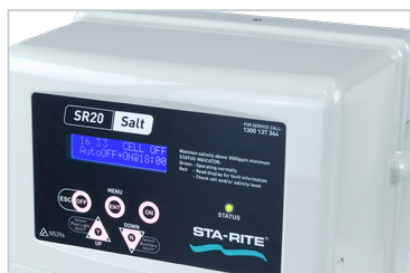
Intuitive Digital Interface